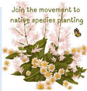
Join the movement to native species planting

To keep up to date on everything happening at the library, be sure to check out our EVENTS CALENDAR on the website!