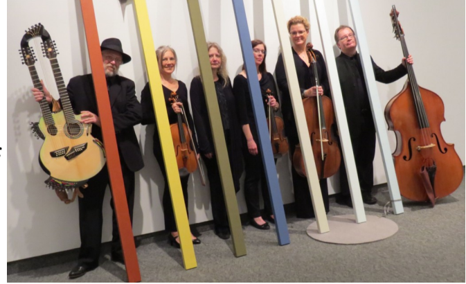
Tickets $20 - available in the library or online