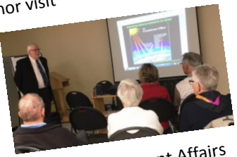
Launch of Current Affairs Discussion Group