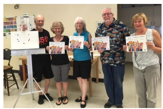
Art 101 spring session wrap-up