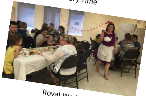
Royal Wedding Tea