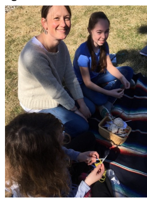
Youth Knitting Group