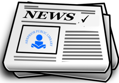
Current Affairs Discussion Group

The library offers a variety of programming and resources for all ages. Make sure you stop by for a visit and inquire about our summer calendar for kids and registration for our Home-bound Delivery Service; View the Art Corridor exhibit; and discover various online resources free with your library card!