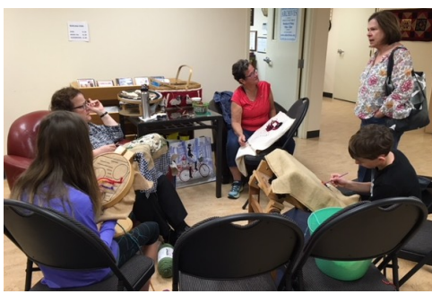
Rug Hooking Exhibit and Demonstration