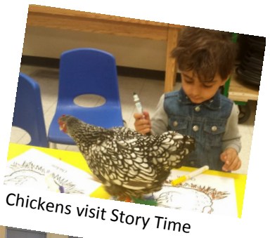
Chickens visit Story Time