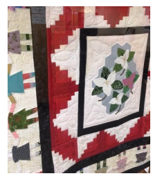
Travelling Quilt Display