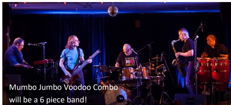
Mumbo Jumbo Voodoo Combo will be a 6 piece band!

will be a huge dance floor in the transformed space. Get your tickets early as we anticipate this will be a sell out event. Doors open at 7:30; dancing starts at 8pm; sampling buffet rolled out around 9pm and special activities will run continuously throughout the evening. There is no better way to beat those mid winter doldrums.