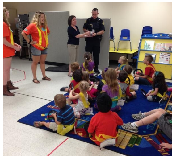
Partnering with the OPP to include safety tips during Summer Programming