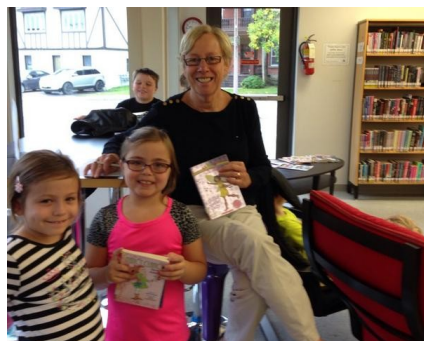
Grade 2 students with their teacher excited to select books for their classroom

Carolyn invites area schools for regular visits. At least 10 teachers bring their students to the library every other week from September to May.