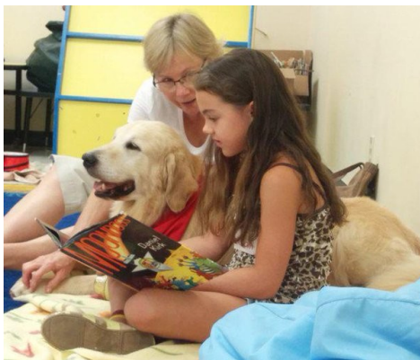
Introducing Ottawa Therapy Dogs for some one-on-one reading time at the library