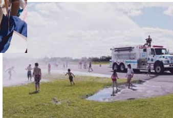
2012 & 2013

TDSRC year end Gala 2014 Super event featuring music, portraits, games and the Fire Department's Chief and Deputy Chief dressed to the nines serving snacks!