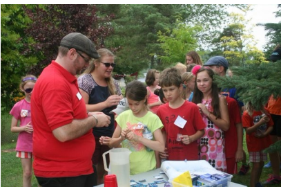
Six activity stations inside and outside for this event.

2015 we invited the National Museum of Science and Technology and transform the library inside and out for our TDSRC finale. More than 130 children read their way to the event.