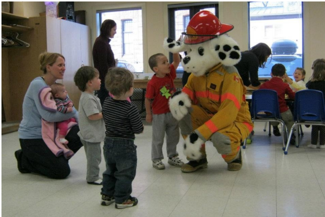
Local Fire Department attends Friday Morning Drop-in Story time programs with special guest Sparky the Fire Dog!