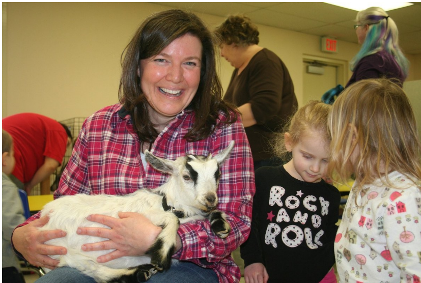
Inviting baby goats to Friday morning drop-in story times!