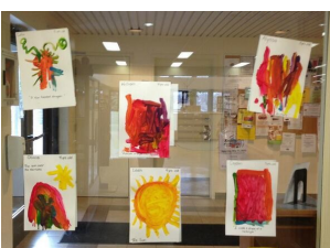
Inviting local day cares to showcase artwork in the library