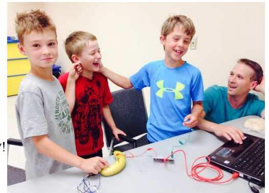
Borrowing Maker Space items from OLITA's lending library to introduce this new technology!