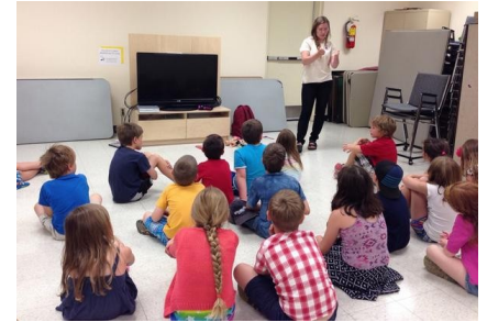
War Amps outreach during March Break Programming