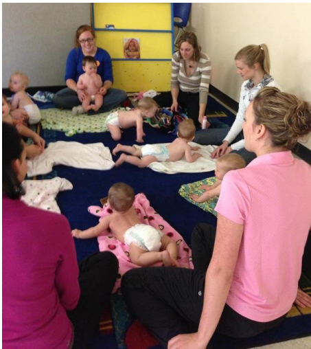
Registered Massage Therapist shares her knowledge at Baby RhymeTime introducing Baby Massage!