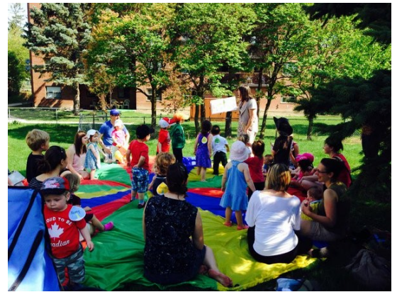
Taking story time outside when weather permits